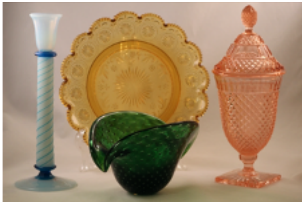
Items from our Archives

We thrive because of you and your interest in our museum’s mission to preserve, enrich, educate and provide unique experiences.